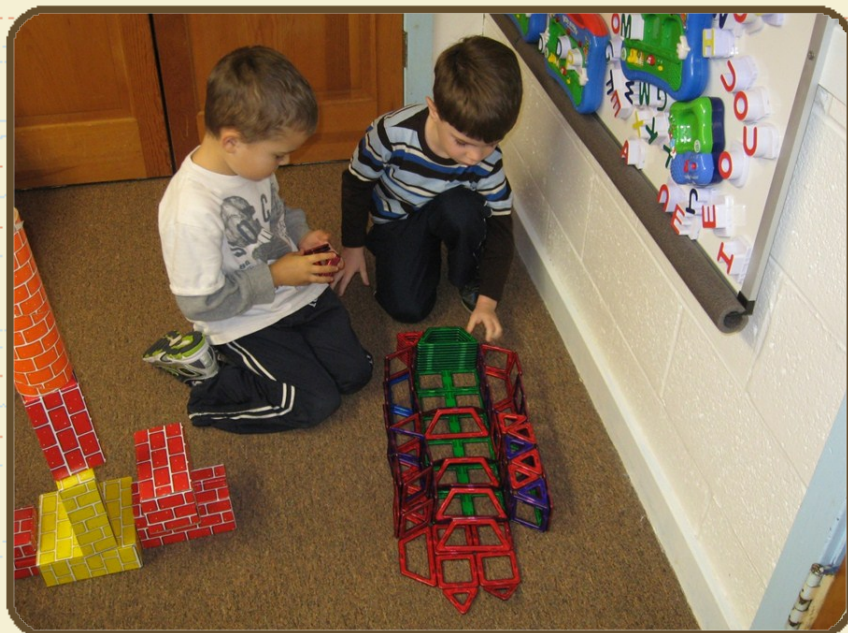
Building Spaceships and learning about the science of magnets