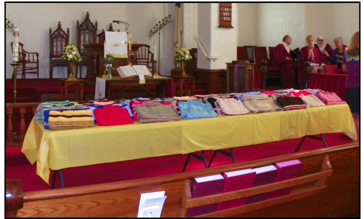
MUMC Knit for Kids project 2014