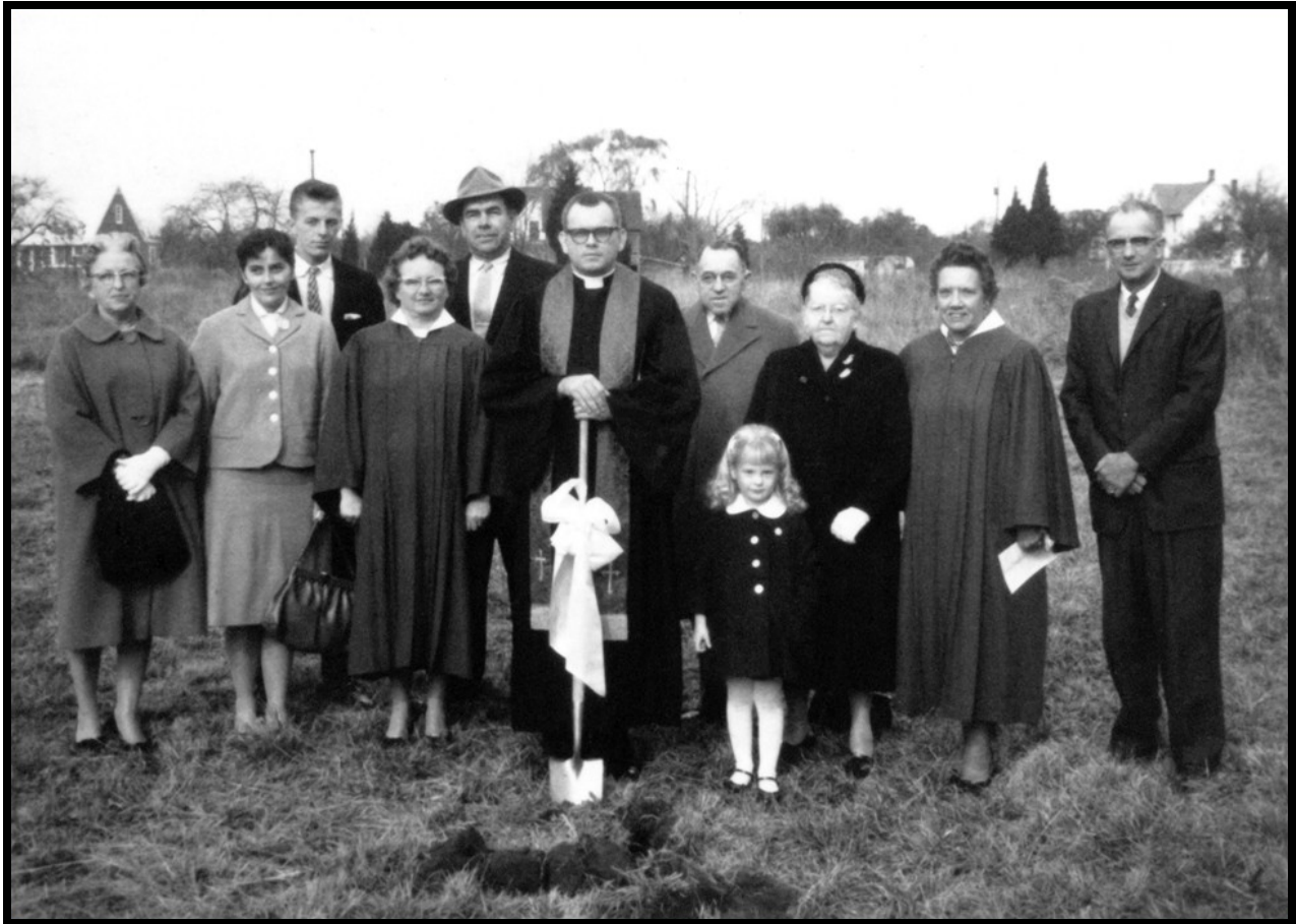
Manahawkin Methodist Church