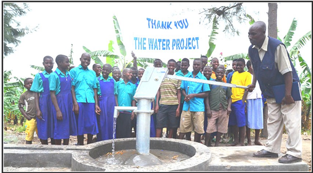
Appeal for Funds to Support Clean Water Projects for Rural Areas in Central Ghana

SUCCESS WE RAISED ENOUGH MONEY TO FUND ONE WELL MORE WELLS ARE NEEDED