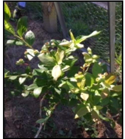
Mulch on top of plastic, was put around our blueberries, with dreams of a good crop in the summer of 2020