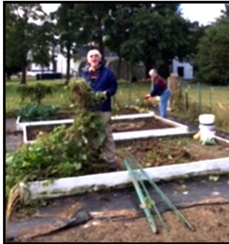
The stakes for the tomatoes and green beans are saved from year to year.