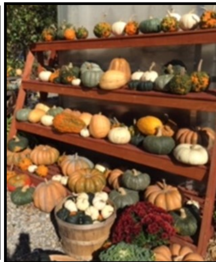
These pumpkins, squash, and gourds are sold at my brothers farm stand in Ct, and what we aspire our produce to look like.

It is time to put the garden to rest for the winter. There are still small heads of broccoli but everything else likes warm weather and died out.